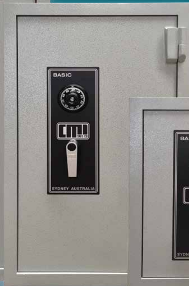
■ MODEL BASIC 2C