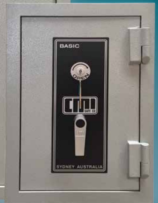
■ MODEL BASIC 1K