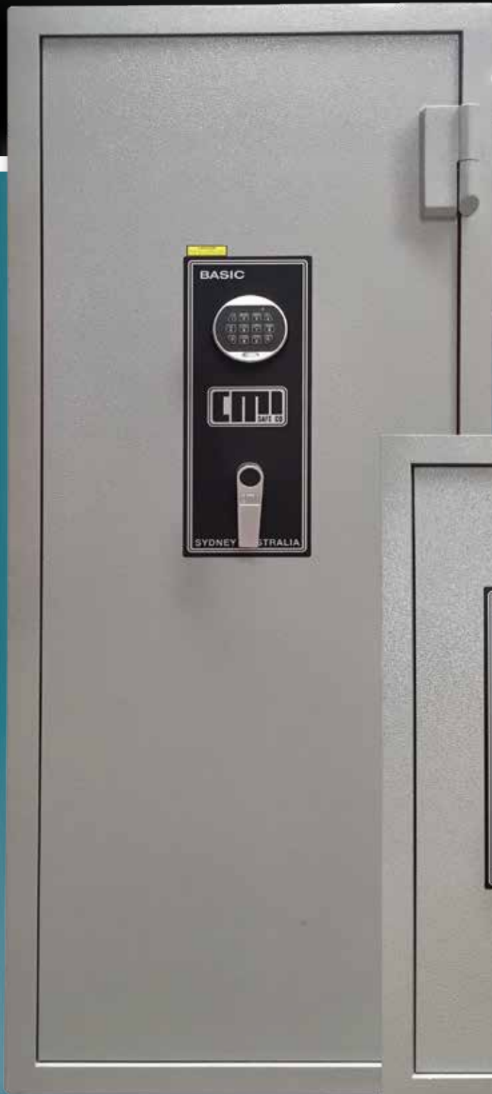
■ MODEL BASIC 3D